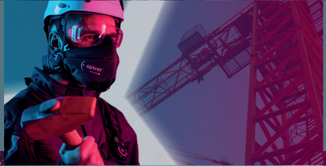
Demolition / Construction / Agriculture / Waste disposal / Recycling