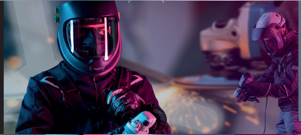
Grinding / metal working / wood working / industrial applications