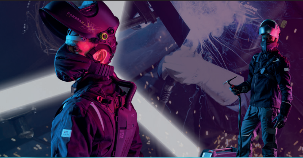
Welding / Plasma cutting