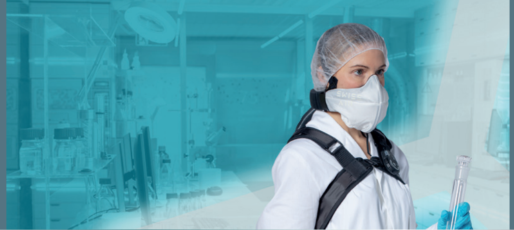
Laboratory applications / pharmaceutical industry