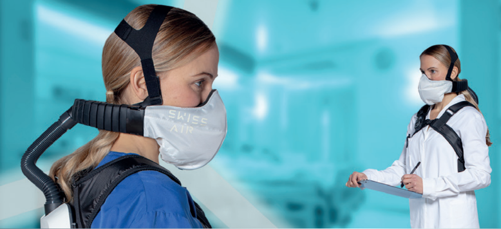
Medical applications / Health care